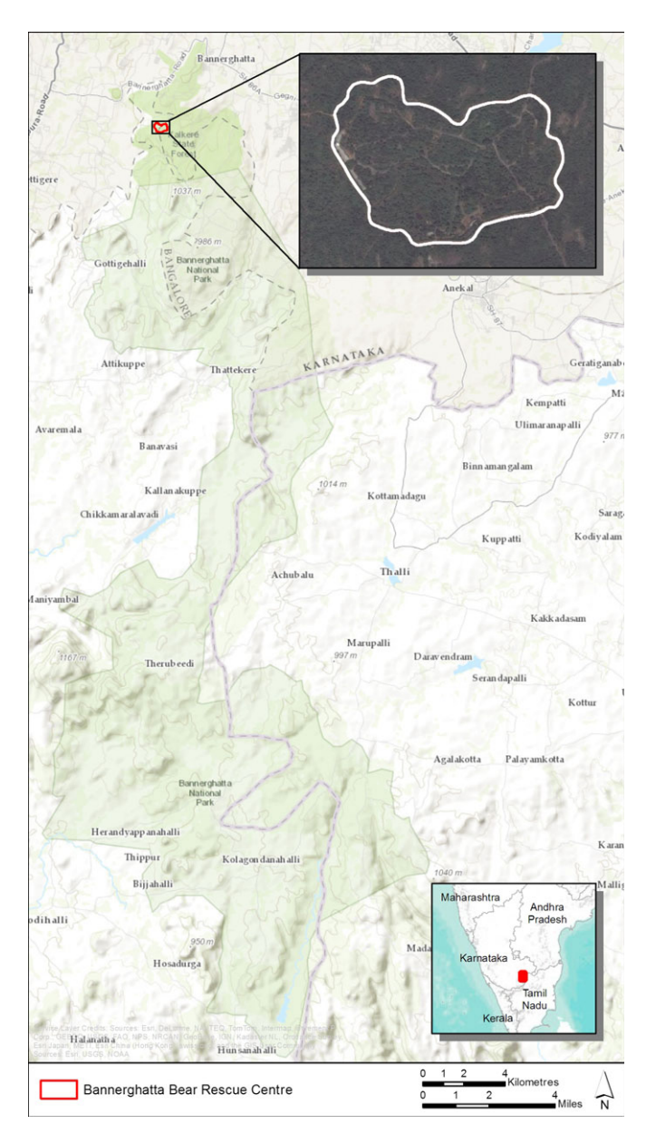
Fig. 1. Bannerghatta Bear Rescue Centre and Bannerghatta National Park, India.

consumption rate to that during the week before parturition), she continued to eat until 24 hours before giving birth. The only other physical characteristic indicative of pregnancy that she exhibited was the shine of her coat, which appeared sleek and