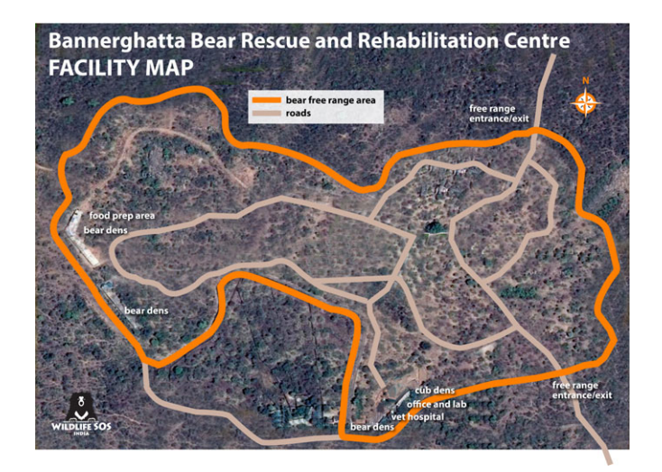
Fig. 2. Facility map of the free-ranging enclosure for Sloth bears Melursus ursinus at Bannerghatta Bear Rescue Centre, India.

meal on 22 November, keepers checked the den site, as she had been observed spending more time in and around it. From the den's entrance, the keepers could hear 1-G and her cubs.