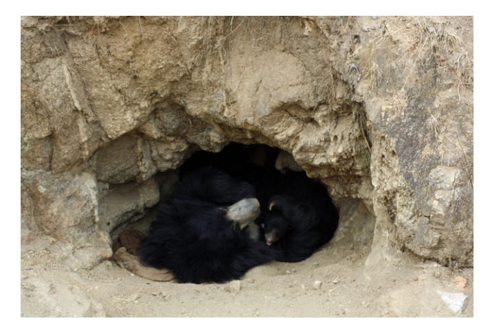
Plate 1. Sloth bear Melursus ursinus (Bear 2-K) with cub in shallow cavity den at Bannerghatta Bear Rescue Centre, India. Wildlife SOS.

Laurie & Seidensticker, 1977; Joshi, 1996; Iswariah, unpubl.) after a period of delayed implantation (Puschmann et al. , 1977). Cubs born in the BBRC were also born during that time period.